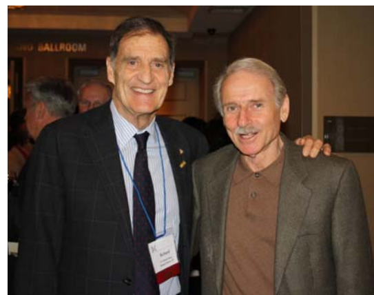
Scenes from the 2014 Steiner/Sinclair Lecture and Dougherty Memorial